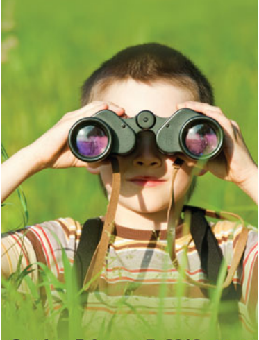
Sunday, February 7, 2016 • 12 – 3: Crowne Plaza • 66 Hale Avenue, White Plaz